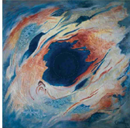
Silence in a Vacuum, Oil on Canvas, 50 x 50cm

For years the people of Africa's distant past have been wandering across the plains, mountains, streams, and deserts of this captivating continent. Africa's people have been living from the rich land and have always been part of nature and nature part of them.