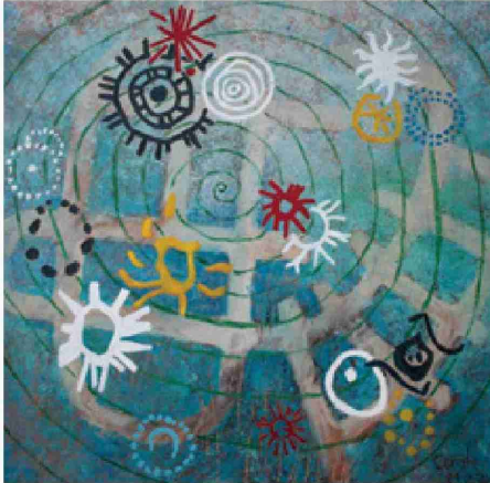
Silence of Time, Oil on Canvas, 50 x 50cm

Page: 56 Publish Date: 01 February 2024 Author: Unspecified